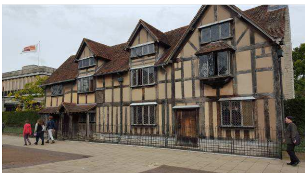
The Bards house

Saturday saw the whole party visiting Stratford, some touring city by boat, some walking and some on the open top bus.